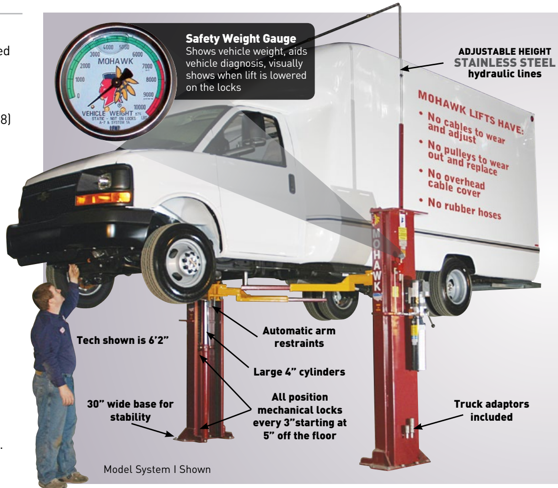
Model System I Shown